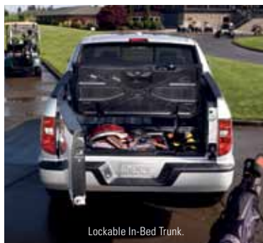
Lockable In-Bed Trunk.