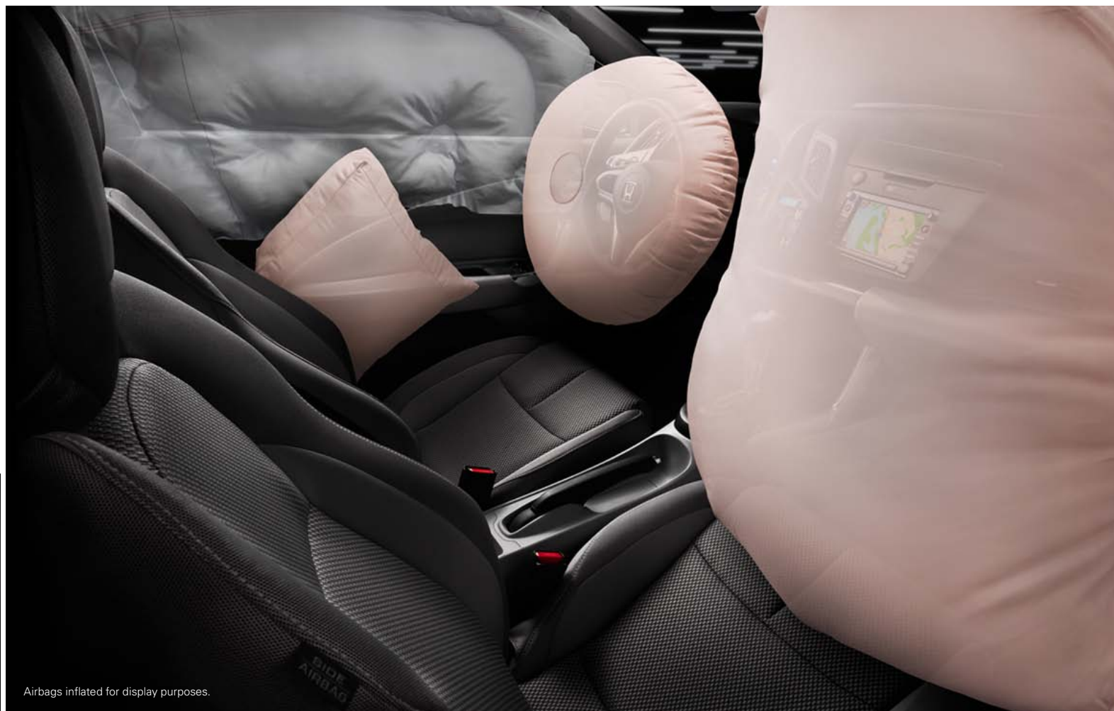
Airbags inflated for display purposes.

Advanced Compatibility Engineering™ (ACE™) enhances occupant protection and crash compatibility in frontal collisions by utilizing a network of connected structural elements to distribute crash energy more evenly throughout the front of the vehicle.